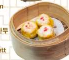
Crystal Prawn Dumpling