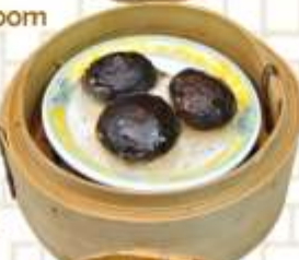
Crab Meat Dumpling