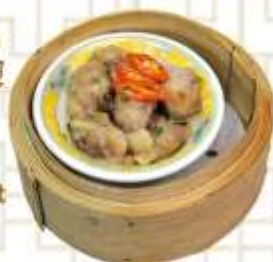
Steamed Mushroom Chicken