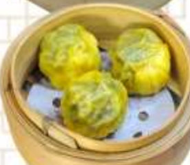
Century Egg Dumpling