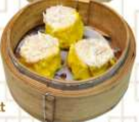
Chicken & Prawn Dumpling