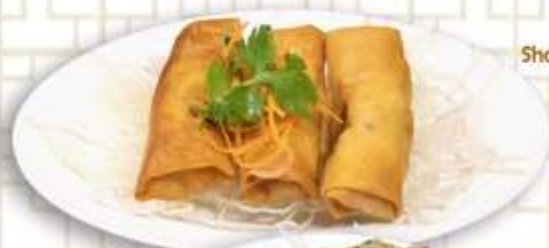
Shanghai Spring Roll