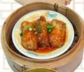
Bean Curd Skin Dumpling