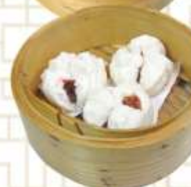
BBQ Chicken Bun 蜜汁鸡肉包