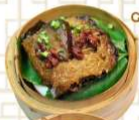
Glutinous Chicken Rice 世紀糯米鸡饭